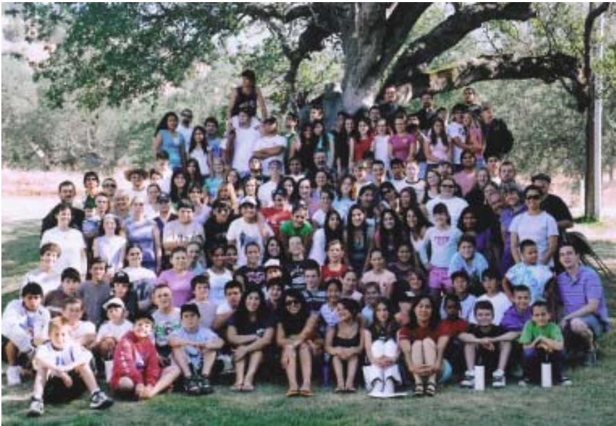
page 20 - Cross Currents