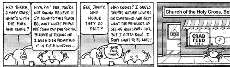
* apologies to Stephan Pastis