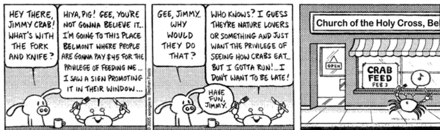
* apologies to Stephan Pastis