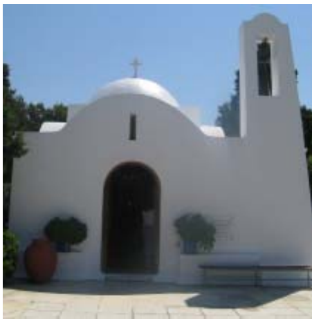
← The chapel at Ionian Village is dedicated to St. James

I don't know why the night works this way here. Staff members are looking to maximize their experience of faith, want to be challenged, and they know their time at Ionian Village is short. They come into the summer with an awareness that they are willing to go above and beyond in the areas of forgiveness, mercy, and reliability. Commitment in these three areas is crucial for a community that is functioning with unity as the center, even when they are challenged. Staff members don't want to leave, they take their commitment here more seriously than most of the commitments they may enter in their lives.