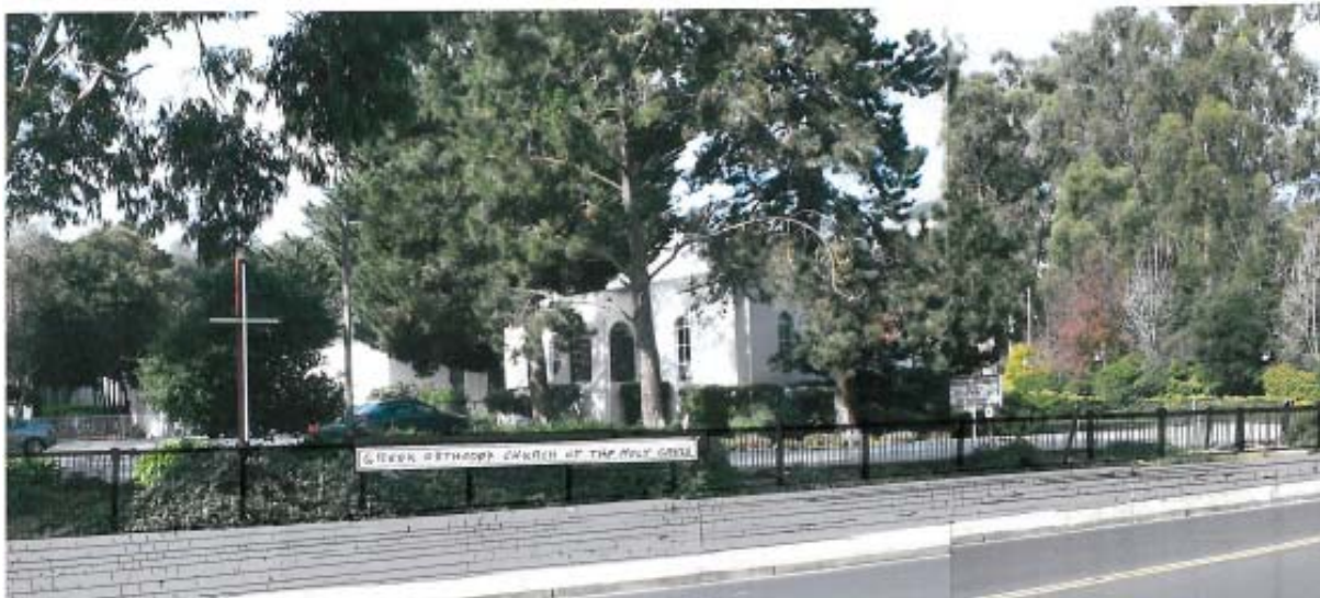
↑ and what it would look like with wall and railing together