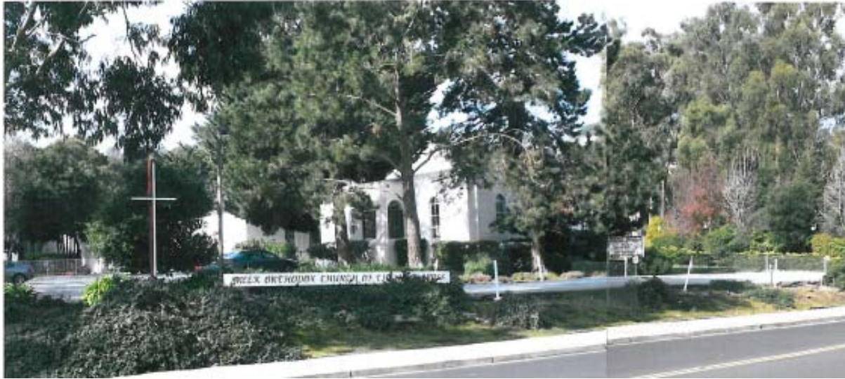
↑ Views depicting the front as-is