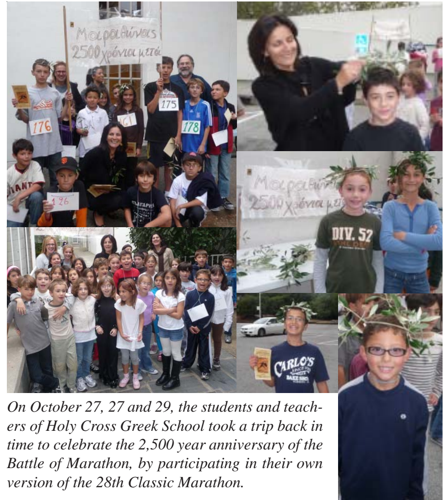
On October 27, 27 and 29, the students and teachers of Holy Cross Greek School took a trip back in time to celebrate the 2,500 year anniversary of the Battle of Marathon, by participating in their own version of the 28th Classic Marathon.

The Holy Cross Greek School wishes you a Merry Christmas and a happy and healthy New Year!!!